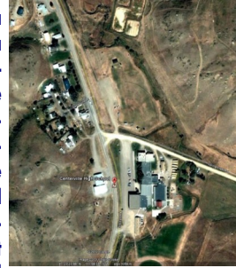
Centerville School Aerial

The festival will be held at the Centerville School at 693 Stockett Rd, Sand Coulee MT. We will have a full double gym with a wooden floor for your toe-tapping pleasure! There will be showers and dressing rooms for our convenience. We plan to have the coolest vendors around for your purchasing pleasure. RVzxcvbjers that come to our event will have dry camping right across the roadway from the event. Pets are welcome. (Leashes and cleanup is a must). Sorry, there is not a dump station on the premises, however there are dump stations in Great Falls. For a list of available dump stations, contact David Hinds. Hotels are available in Great Falls only 22 minutes away from the dance hall. There will be plenty of parking right outside the dance hall. Plan on a GREAT TIME at Centerville School on our Long Dance Train.